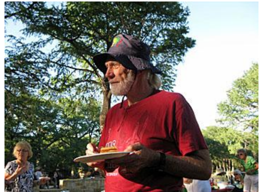
"I'm immobilized by all this good food!"