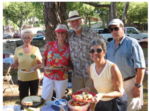
There's nothing like good food & good company to put a smile on everyone's face.