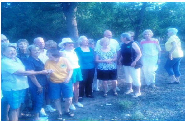
Trailblazers enjoying our picnic at Judge Brown's river cabin in May