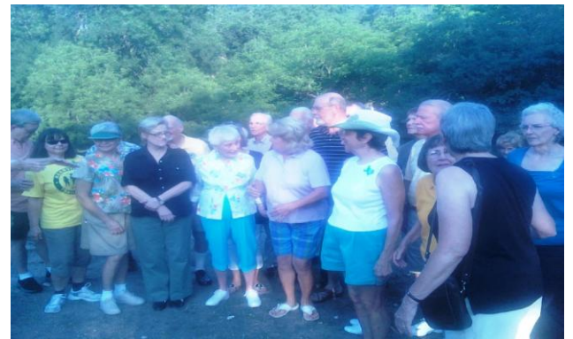
Photographer trying to get everyone to look at the camera for a group picture